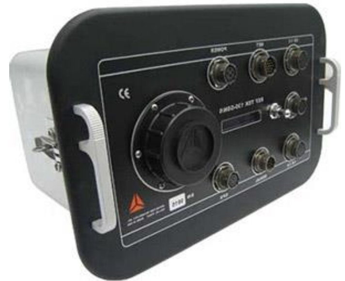
REFTEK™ Earthquake Sensor